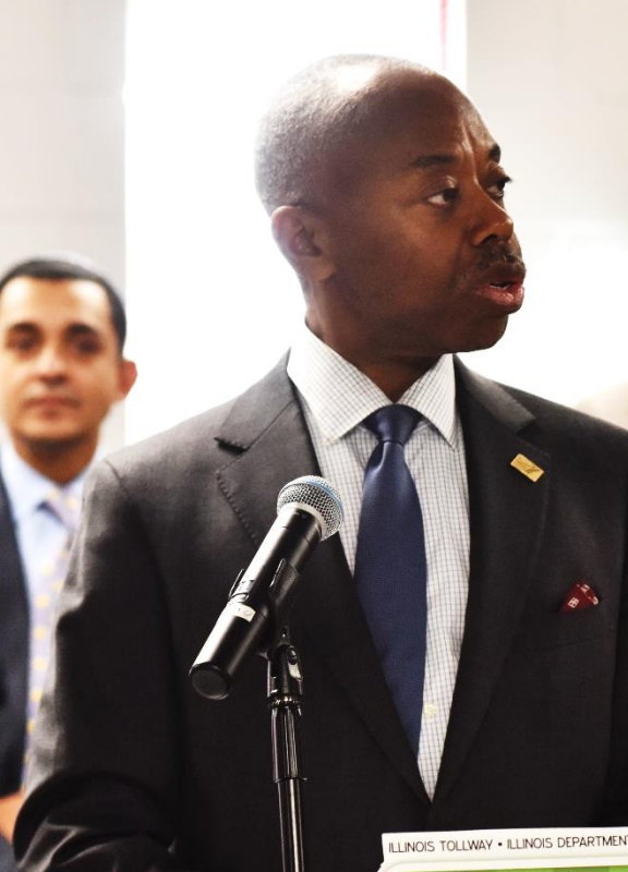
ILLINOIS TOLLWAY • ILLINOIS DEPARTMENT