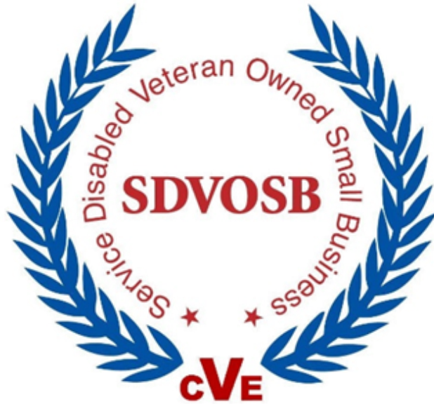
Center for Veteran Enterprise (CVE) SDVOSB/VOSB