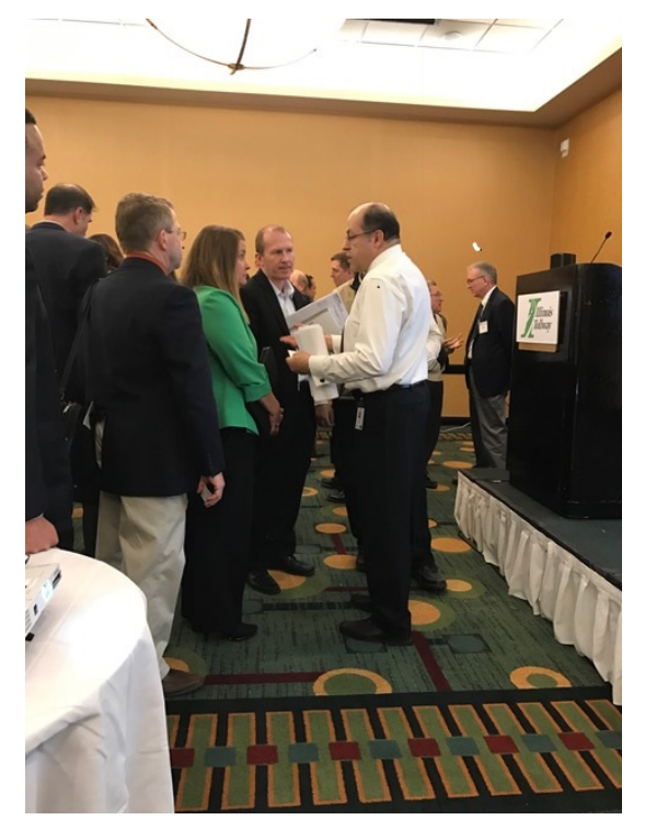
2017 Professional Services Bulletin Networking Event March 14, 2017

Policy Committee June 5, 2017 at 10 a.m.