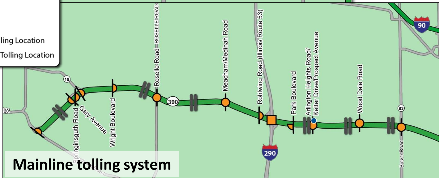
Mainline tolling system