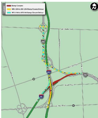
WB I-290 to SB I-294 and WB I-88 View Map