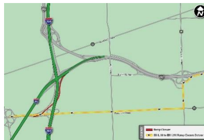
EB Roosevelt Rd to EB I-290 View Map