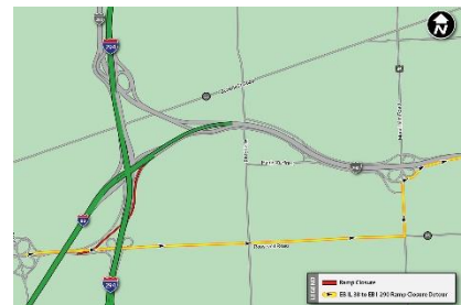
SB I-294 to EB I-290 View Map

Work in July will also require overnight lane closures on I-290 in both directions for bridge reconstruction work on northbound I-294 over I-290, including intermittent full closures, each lasting 15-minutes.