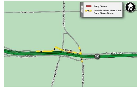
View Prospect Avenue to WB IL 390 Detour Map