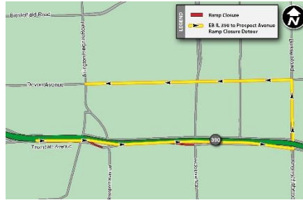
View EB IL 390 to Prospect Avenue Detour Map