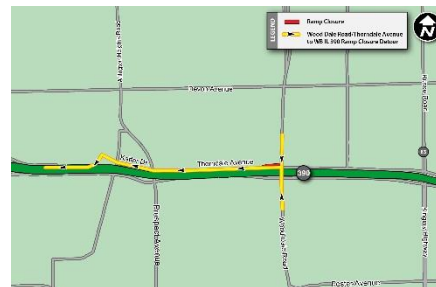
View Wood Dale Road to WB IL 390 Detour Map

In 2022, the Illinois Tollway is repairing mainline and ramp bridge structures along the Illinois Route 390 Tollway between Gary Avenue and Lively Boulevard. Work is expected to continue into the fall at various locations in both directions on Illinois Route 390 and on exit and entrance ramps for bridge joint repair work. A total of 16 mainline and ramp bridges require repair work between Gary Avenue and Lively Boulevard, including 12 that will require detours. Closures will be scheduled as needed through fall to complete this work.