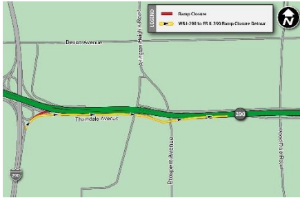
View WB I-290 to EB IL 390 Detour Map